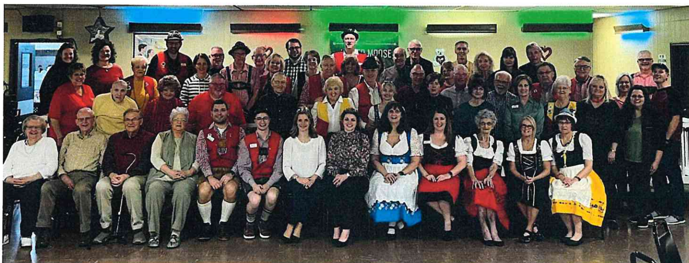
The Jasper Deutscher Verein