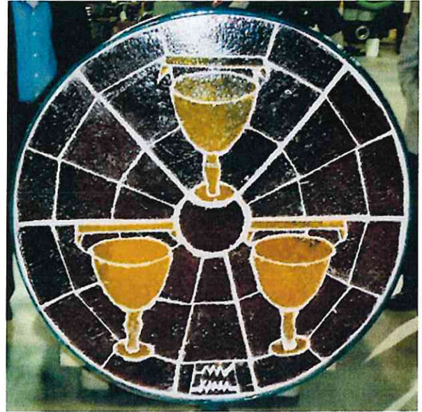
25th Anniversary Gift from Pfaffenweiler

(Taken from: https://www.bhg.com/recipe/hamburger-cheese-bake/?printview )