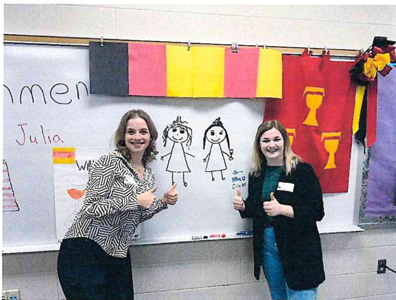
L to R