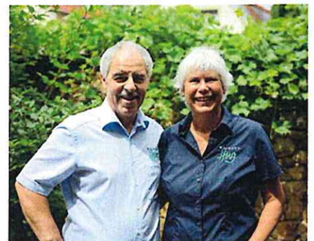
Hug Winery in Pfaffenweiler